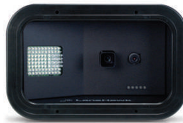
LaneHawk Intelligent Lighting and Camera Unit

The Enterprise Manager keeps track of LaneHawk lane status, software updates, modelsets, and most importantly, generates reports to detail cashier performance.